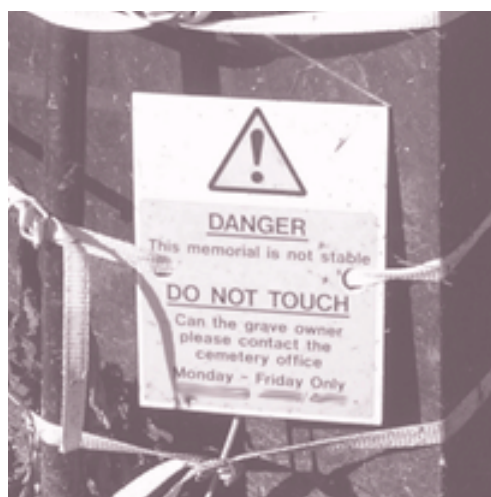
Notice on unsafe memorial