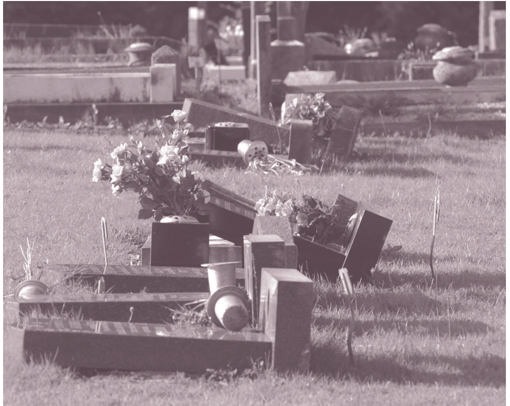
Result of health and safety testing in cemeteries

Desecrated. 372 tombstones felled ... but not by louts ... this time it's council morons. The Sun 8 September 2004 on testing by Camarthenshire County Council.