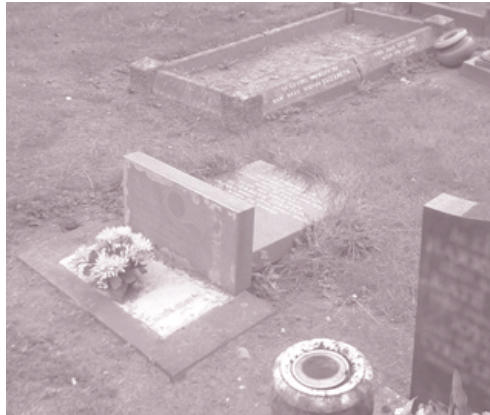
Inadequately secured memorial

In July 2001 HSE and the Local Authorities Enforcement Liaison Committee issued guidance (LAC 23/18) to local authority enforcement officers on the exercise of their powers under the Health and Safety at Work etc Act. The HSE later said it was not intended to be taken as guidance to burial authorities on their responsibilities. The document was subsequently withdrawn to avoid confusion. The Chair of the Health and Safety Commission (HSC) wrote to his regional directors and councils' chief executives in June 2004 to make it clear that HSE had issued no guidance on memorial safety and that it was a matter for individual burial authorities to determine. He urged burial authorities to follow industry guidance so that the issue was handled with the utmost sensitivity, referring to the adverse publicity and public anger caused by the indiscriminate action of a small number of local authorities.