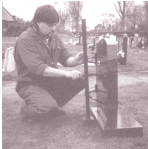
Odlings Makesafe support used by the Corporation of London