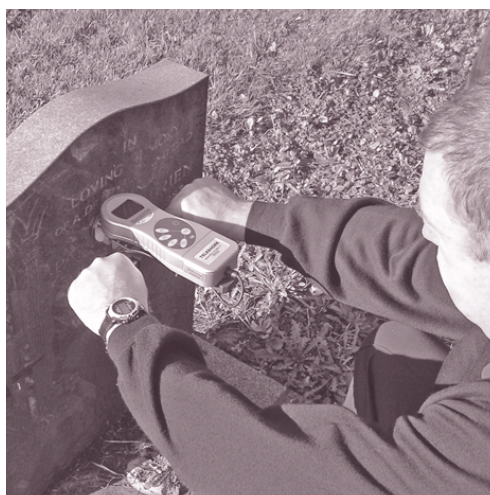
Force measuring instrument