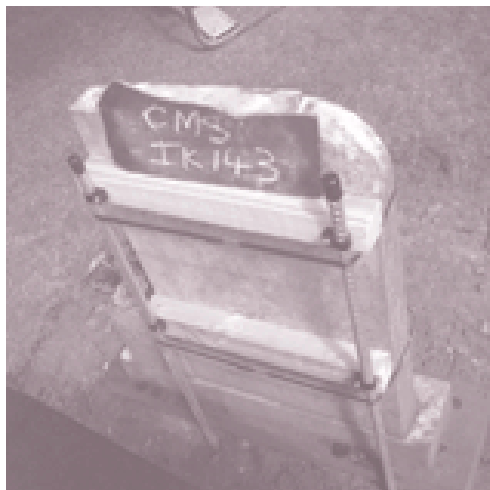
Method of support used by Stoke-on-Trent City Council

To cordon off a memorial with brightly-coloured hazard tape or meshing and warning signs, or to shroud it with a bright yellow plastic warning cover does not remove the risk posed by an unstable memorial. At best these provide a short-term solution by warning the public that a hazard exists. At worst they have provoked public outrage by striking a discordant note in the cemetery's setting.