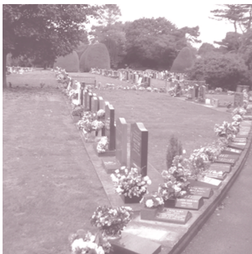
Cemetery with lawn memorials

Of the 600,000 people who die each year just over one third are buried. Of these about half have new graves, the rest being placed in existing graves. Since the mid-1950s the most common type of grave memorial has been the lawn memorial.