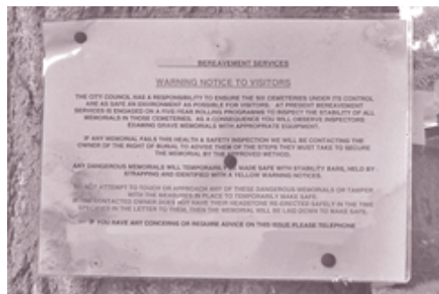
Notice of test in cemetery

Councils are increasingly aware that much of the public disquiet that memorial safety testing has generated can be reduced or prevented by a carefully considered programme of public information before testing begins.