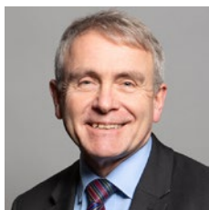
Robert Goodwill MP APPG Vice Chair

The impact of the COVID-19 pandemic has been felt in every community in the UK and by so many individual families and businesses. All of us in the All-Party Group for Funerals and Bereavement realise that there has now been much more media attention on this important sector which we all care about and which has often been overlooked previously.