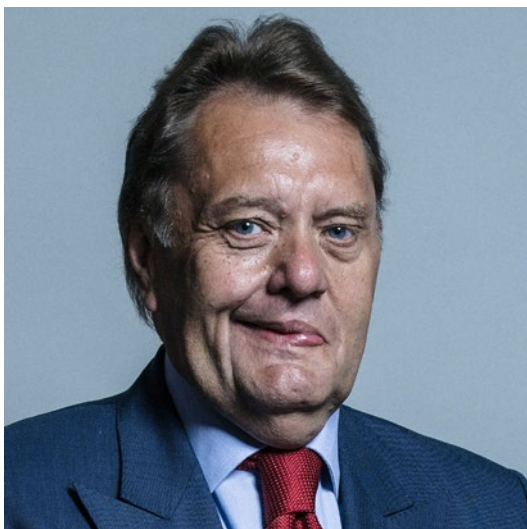
Sir John Hayes MP

I am delighted to welcome you to the inaugural edition of Funeral and Bereavement News. This monthly Newsletter will provide updates on the work being done by the All-Party Parliamentary Group for Funerals and Bereavement, the Deceased Management Advisory Group (DMAG) and the wider sector, along with a deeper insight into some of the organisations that exist within it.