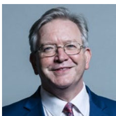
Peter Dowd MP

Having served in Government in four different Departments as well as in the Whips Office, I am also well placed to advise on the cross-Governmental nature of so much of what we do. I am committed to helping the sector to have a louder and more joined-up voice at the heart of Government. Where the death care sector finds itself navigating a path through different Whitehall departments from the Home Office to the Ministry of Justice and the Ministry of Housing, Communities and Local Government, I hope the APPG will be able to be voice of reason, ensuring the businesses at the heart of the funeral and death care sector receive the support they deserve during this critical period in our nation's history. I am glad to be part of the APPG and will be encouraging other MPs across the House to also get more involved in our activities.