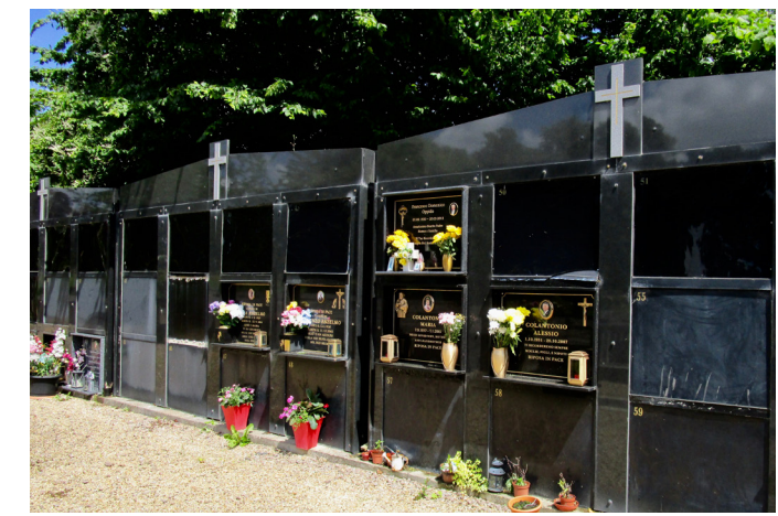
Collaboration service providers and community to design, build and fund mausoleums

Local authorities and planners could liaise with local