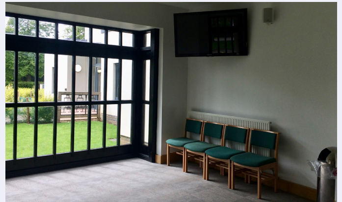
Crematorium anteroom to accomodate large funera