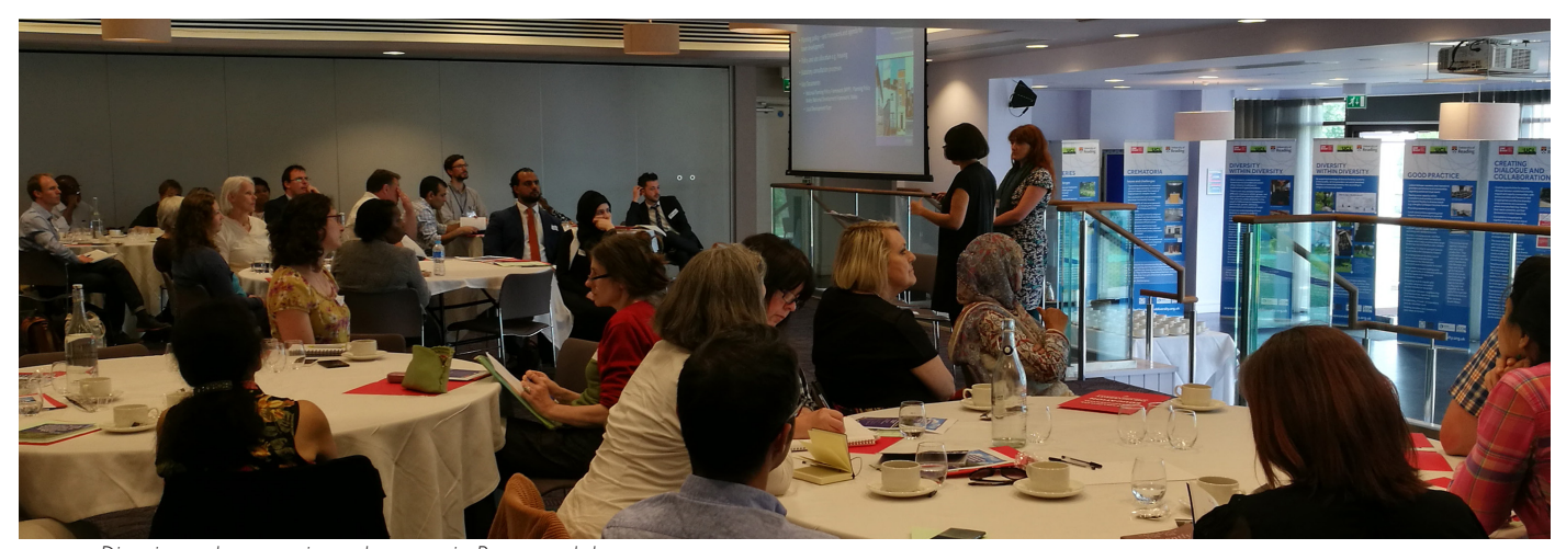
Diversity-ready cemeteries and crematoria, Report workshop June 2018, University of Reading

More research is needed in towns and cities with diverse populations and significant development pressures, and in Scotland and Northern Ireland.