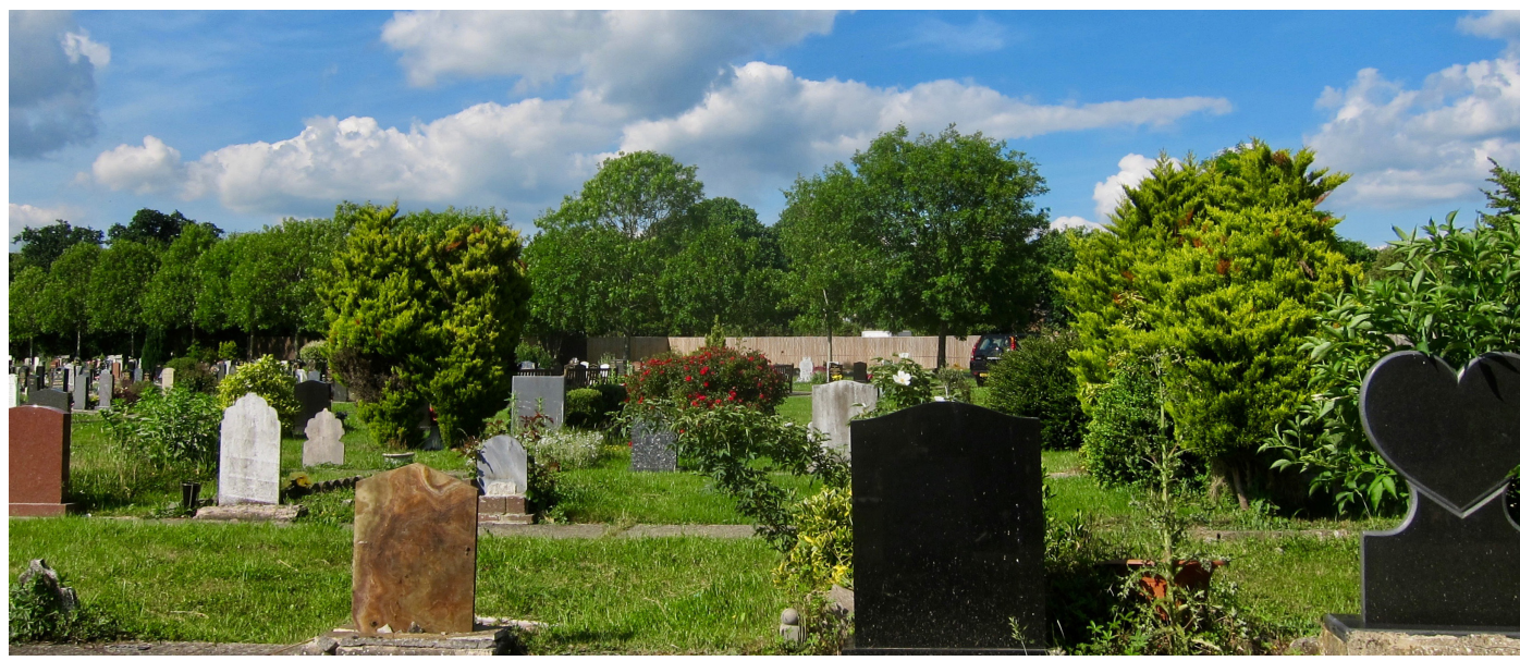
Muslim graves at cemetery

Diversity-ready cemeteries, crematoria and remembrance sites are a necessary but currently neglected aspect of an inclusive and integrated multicultural society. Addressing these issues will contribute to greater social well-being and a more inclusive civic culture.