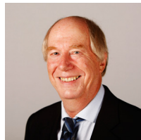
Malcolm Chisholm Scottish Labour