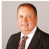
Colin Keir Scottish National Party