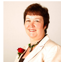
Rhoda Grant Scottish Labour