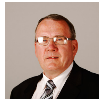
Richard Lyle Scottish National Party