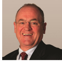
Convener Duncan McNeil Scottish Labour